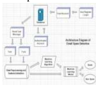
Fig -1: Architecture Diagram of Email Spam Detection

Section 1 presented the system's output, which included classification findings, statistical data, and graphical aids to help with comprehension and research.