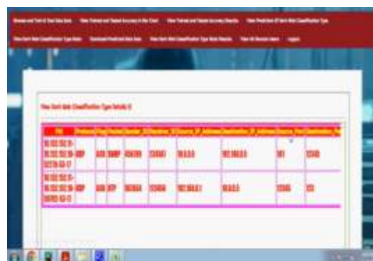
Dark Web Classification Type Details