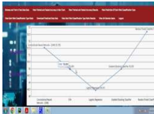
Trained and Tested Accuracy in Line Chart