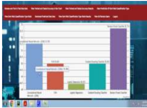
Trained and Tested Accuracy in Bar Chart