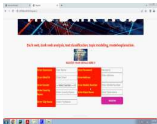
User Registration Page