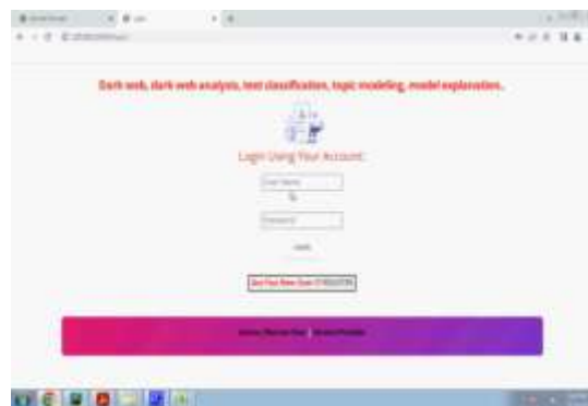
User Login Page