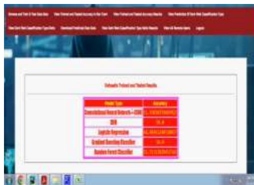
Datasets Trained and Tested Results