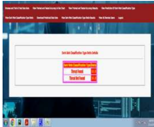
Dark Web Classification Type Ratio Details